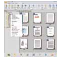
The PaperPort SE14 main screen

- The Professional Choice to Organize and Share Your Documents