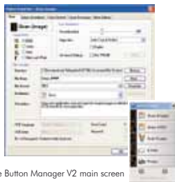
The Button Manager V2 main screen

Button Manager V2 makes it easy for you to scan and send your image to your favorite destinations with a press one button. Now the new version comes with an innovative feature to let you scan and automatically upload the scanned document to popular cloud repositories such as Google Docs, Microsoft SharePoint, or FTP. In addition, the iScan feature allows you to insert the scanned image or recognized text after optional OCR (Optical Character Recognition) process to your text editor such as Microsoft Word to get your job done easily and quickly.