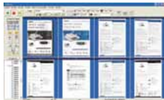
The AVScan X main screen

-The Intelligent Document Management Tool