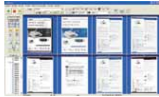
The AvScan 5.0 main screen

-The Intelligent Document Management Tool